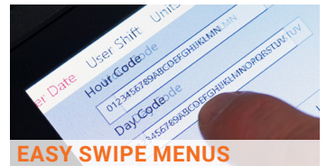
EASY SWIPE MENUS